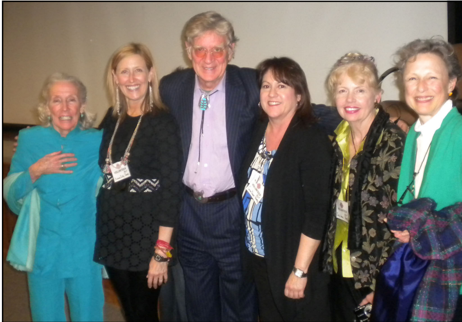
Dr. Robert Thurman (above, center) headlined AFoT's Spring events with a presentation to a sold-out crowd in March.

(See pages 2-3 for list of grant recipients and AFoT activities in the President's Corner)